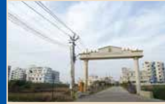
PRAGATHI NAGAR Mangamoor Road, Ongole