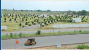
PRAGATHI HIGH-WAY TOWNSHIP Doddavarappadu