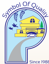
PRAGATHI - SRI SAI AASHRITHA Venkateswara Colony, Ongole.