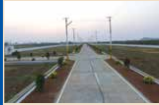
PRAGATHI RESIDENCY Mangamoor Road, Ongole